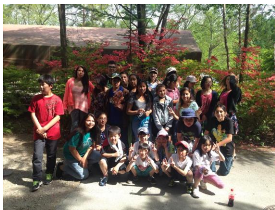
Students and their host families at a mountain retreat

You can view dozens of photos by going to Facebook and searching "Kawakami-mura 2015" and "Kawakami Watsonville Sister City Association."