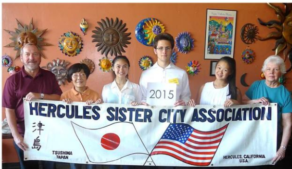
Hercules Youth Ambassadors to Tsushima

Since their selection by the Hercules Sister City Association as Youth Ambassadors, three Hercules High students have been conducting fundraising events. They have been learning a speech about themselves in Japanese as well as absorbing many Japanese customs that will prepare them for their two week trip to Japan during late July and early August 2015. Accompanied by three adult chaperones, their homestay experience in Tsushima will include a welcome potluck event attended by many citizens and City officials where they will be re-acquainted with the members of the Tsushima Friendship Delegation that visited Hercules in early August 2014. Other events will be witnessing the Owari Tsushima Tenno Festival and tours of selected cultural sites. After leaving Tsushima, tours of Hiroshima, Kyoto, and Tokyo will round out their immersion in as much of what Japan has to offer as time will allow.