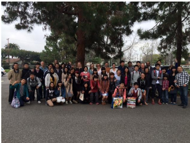
Students with their host families

Santa Clara Sister Cities hosted two student exchanges this spring: our traditional middle school exchange with Izumo, Japan in late March, and an additional student exchange with 16 high school students from Izumo High School in early March. The high school exchange was part of program initiated by the Japanese government called "Super Global High School Program," which aims to foster global leaders. Students are equipped with an awareness and deep knowledge of social issues, communication and problem-solving skills, and other globally competitive skills. The students spent 5 days in Santa Clara visiting Apple and other corporations, the Tech Museum, Adrian Wilcox High School and quality time with their host families. Prior to coming to Santa Clara, the Japanese Club at Wilcox High School and Izumo High School students Skyped at least once a month to get to know each other and discuss issues that were important to them. We look forward to welcoming them again in January 2016.