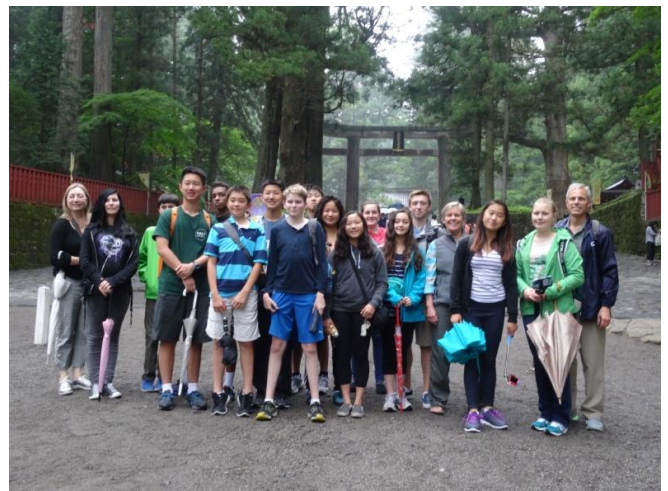
The group visiting a shrine in Nikko

The City of Tsuchiura also arranged for our students to learn how to make soba noodles from scratch and also arranged for us to attend a meditation and tea ceremony.